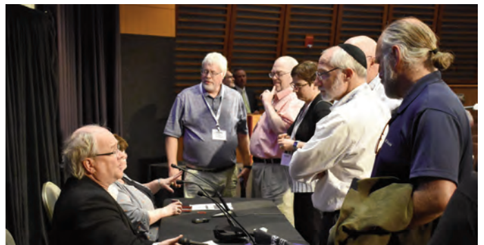
ICOO2018 attendees learning from thought leaders.