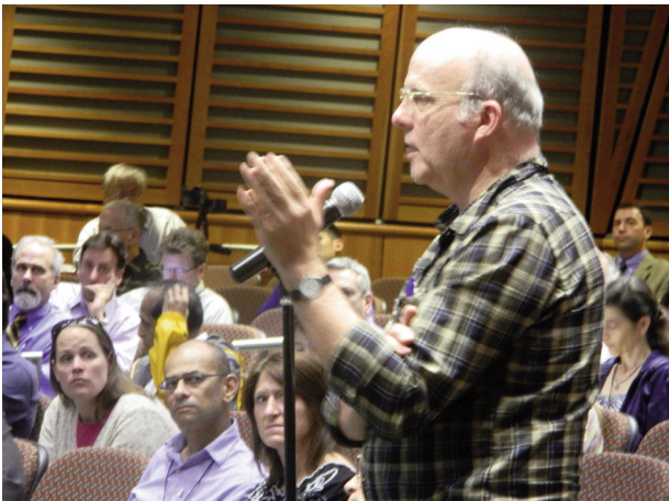
Question and answer sessions probed the intricacies of opioid prescription and resonated a deep concern for the future of opioid therapies.