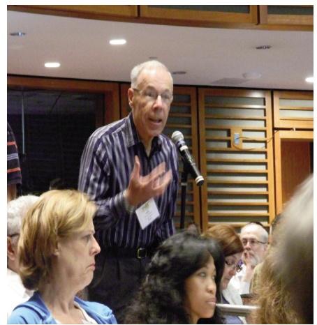
Question and answer sessions were quite lively and passionate.