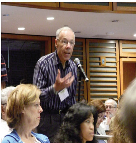
Question and answer sessions were quite lively and passionate.