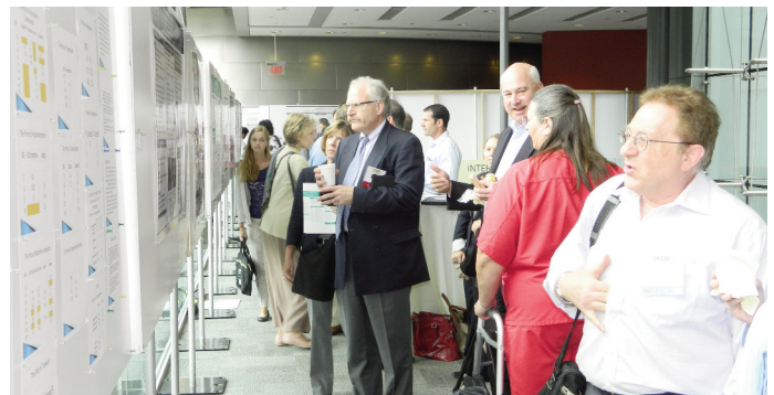
Posters were presented over two days in the unique “skyway” at the Joseph B. Martin conference center.